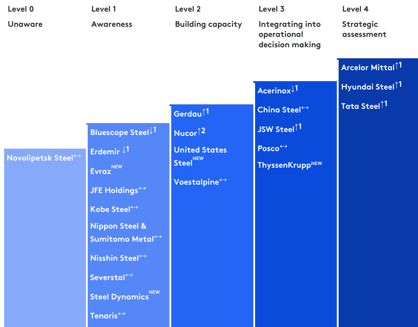
Figure 1. Management quality of the world's top steel makers

Four companies are newly assessed this year. Of these, Evraz and Steel Dynamics are on Level 1, United States Steel is on Level 2, and ThyssenKrupp is on Level 3.